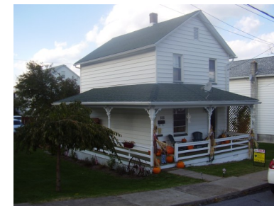
306 Front St., Dupont

Check the listing through www.classicproperties.com or contact me directly at 570-817-0706 for more information or to set up a private showing.