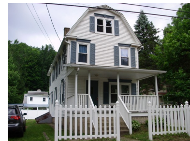
77 2nd Street, Harveys Lake

Enjoy lake living in this 3 bedroom, 2 bath home on a large corner lot. It features some hardwood floors, new cabinets, and a new privacy fence. It is walking distance from the lake.