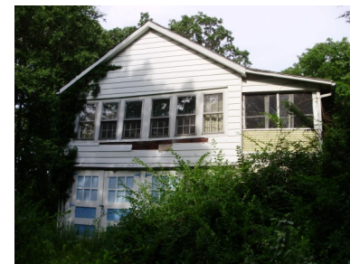
1 Pittston Blvd, Bear Creek Twp

For more information or to schedule a private showing call 570-817-0706